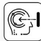
Proactive Facial Recognition