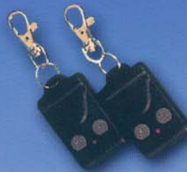
CPT - 870 Remote Control