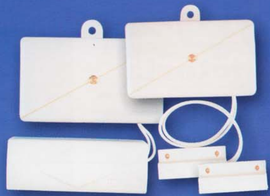
CPT - 873 Wireless Magnetic Transmitter/ Vibration Detector