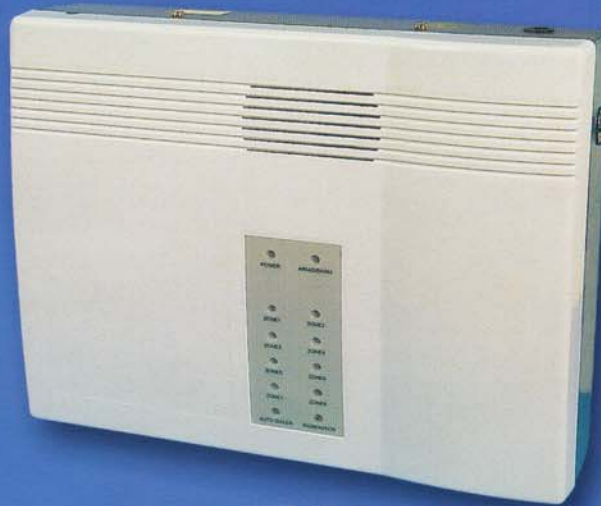
CPT - 868 Control Unit