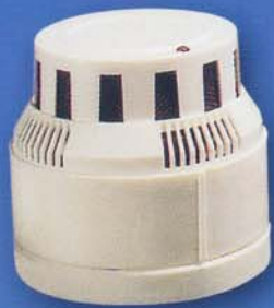
CPT - 871 Wireless Smoke Detector