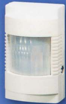
CPT - 869 Passive I/R Detector/Transmitter