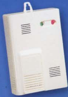
CPT - 872 Wireless Gas Detector